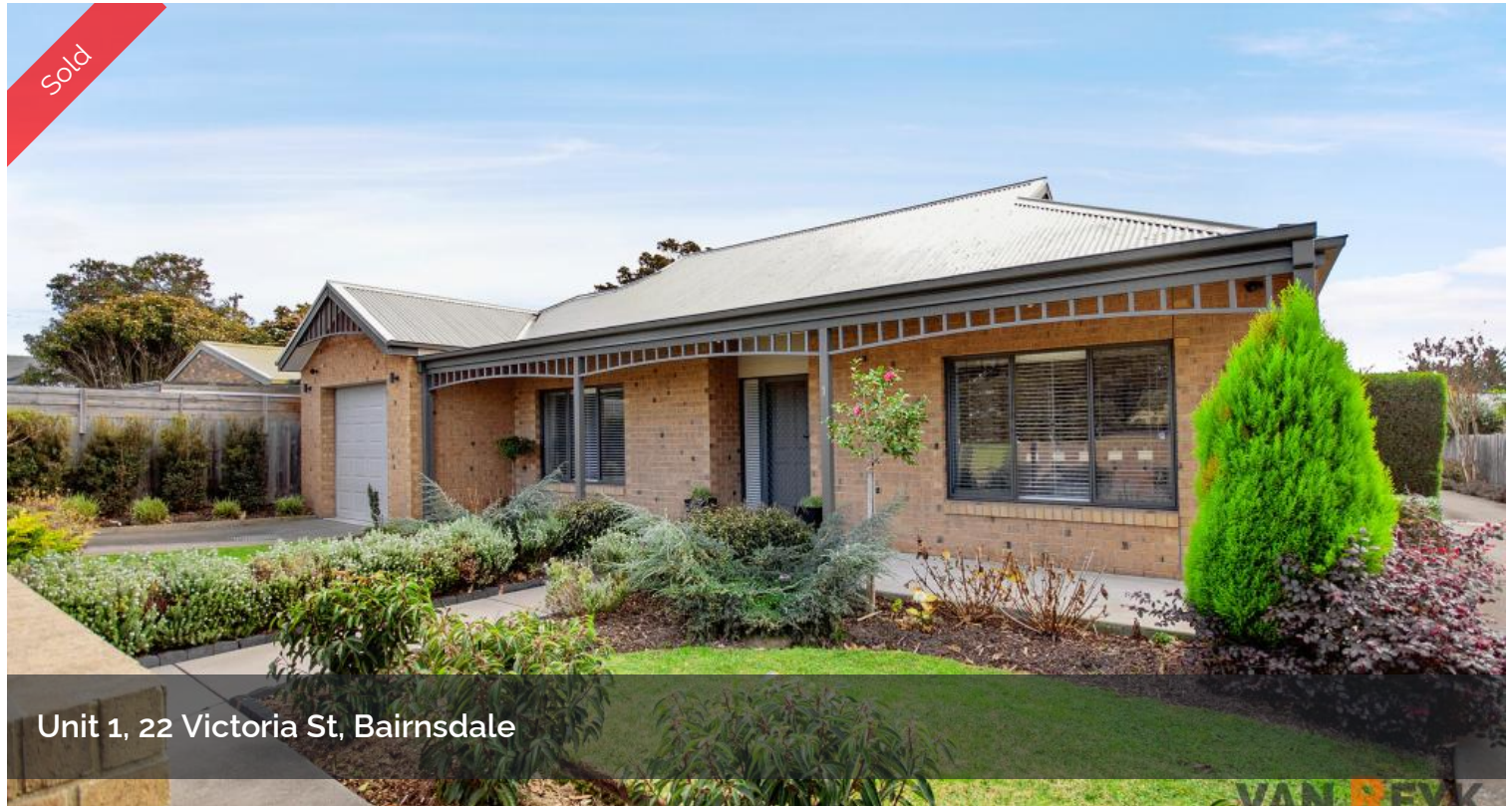
Unit 1, 22 Victoria St, Bairnsdale